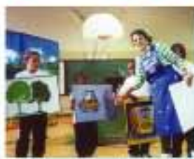
Live presentations and materials for schools