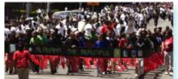
Nation's Largest Earth Day Parade for Children