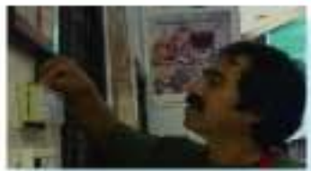
"Ecomercials" to air statewide

Join the Auntie Litter Team! Great Sponsorship Opportunities for 2009