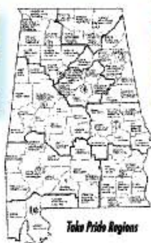
Take Pride Regions